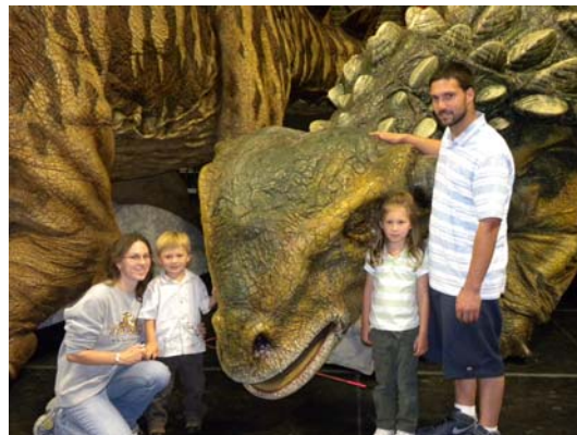
The Gummer Family are among the CMOST members who went behind the scenes.

CMOST members and staff meet the Dinosaurs back stage after the show!